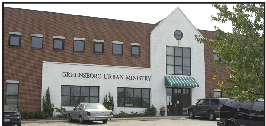
Greensboro Urban Ministry Today

jungle and his rescue by a U. S. submarine about six months later is an intriguing story for another time.