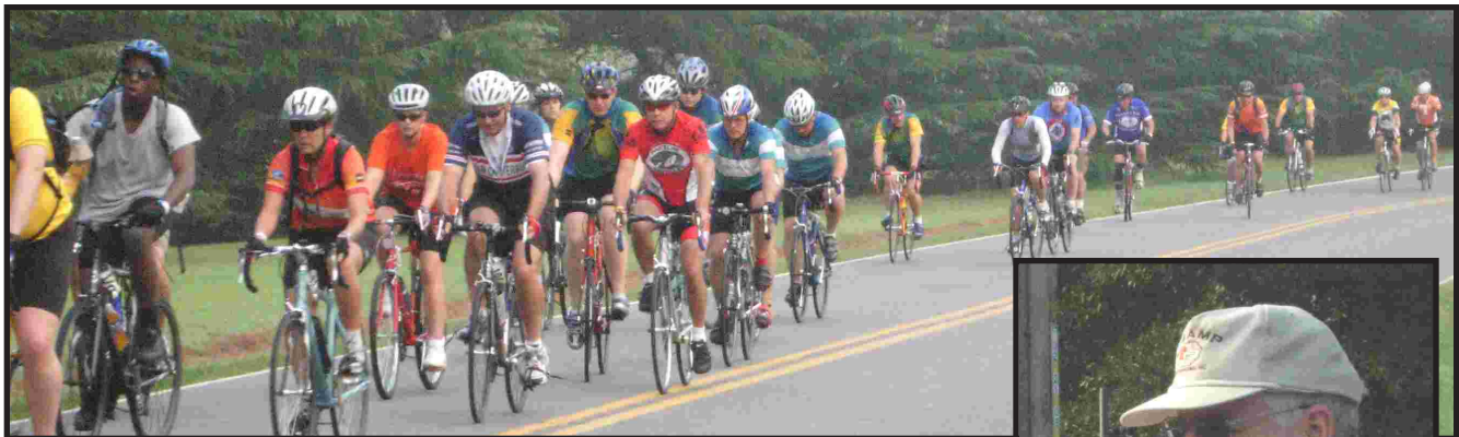
The 2006 BB&T MS Tour to Tanglewood, start Sunday morning.