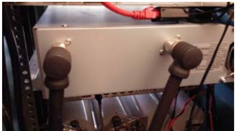
Superflex Heliex jumpers that replaced the old ones, and 9 adapters.

Looking forward into the next few months we should be getting in the Yaesu DR-1x repeater, as of the time of this article, they are probably about two months on backorder due to literally hundreds of orders in North America from clubs taking advantage