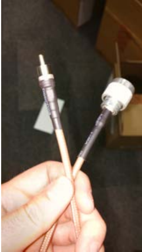
The new jumper to I made, going from the D-Star machine to the GE Mastr II amp.

of the offer. We also need to get the new controller online as well; it will require building from a kit, and extensive programming to replicate what we mostly have in place now. I hope to see everyone at the Club Picnic, and please check out the W4GSO website at www.w4gso.org , and register for the forums, we have a topic going currently showing member's ham shacks and it would be great to see yours!