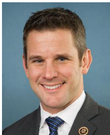
US Rep. Adam Kinzinger (R-IL).

As with H.R. 1301, the new measure introduced on January 13 in the 115th Congress was sponsored by Rep. Adam Kinzinger (R-IL), with initial co-sponsorship by Rep. Joe Courtney (D-CT) and Rep. Greg Walden, W7EQI (R-OR). Walden now chairs the House Committee on Energy and Commerce, to which the new bill has been referred. H.R. 555 will get an initial airing in the Subcommittee on Communications and Technology. When H.R. 1301 came up in committee, Walden spoke forcefully in favor of the measure, which ultimately attracted 126 House cosponsors.