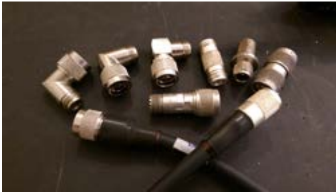
Removed extra adapters and cable not needed in the install to reduce loss. More will come off when new heliax jumpers are made with the right connectors on them.

David, KK4VCG, came out to help with the D-STAR Linux based gateway to help do a backup. We ran into an issue with the usb thumb drive partition and the backup service was started but could not complete. We broke the gateway linking in the process because the machine thought it was doing