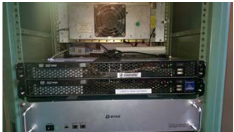
Removed 4ft long Ethernet jumpers and replaced with 1ft jumpers to clean up the install a bit.