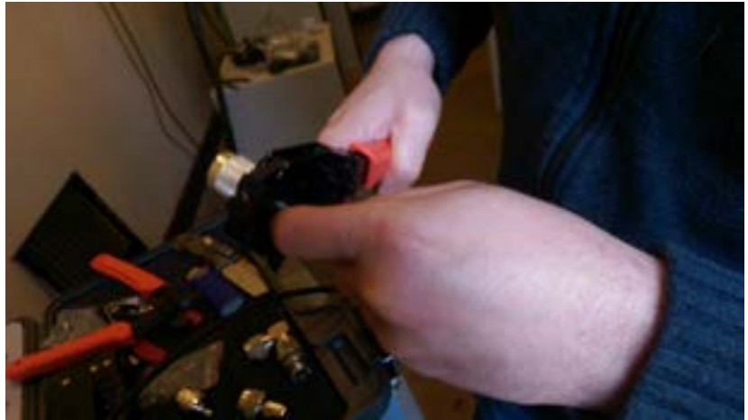
Crimping a new connector

March was a busy month for the engineering committee! At the beginning of the month the UPS backup power supply that failed at the end of February was replaced on the VHF machine. Also, Patrick, K2CPR, and I removed the lower VHF backup machine to clean out the residue left behind from a rodent invasion! Inside the repeater and all over the bottom of the cabinet seemed to be a rest stop for our rodent friends at the repeater site. They also visited the paper packing around the VHF duplexer and the bottom of the cabinet. Everything was cleaned, repeater installed, and a excess telephone alarm line was removed. At this time we also switched the VHF machine to the backup that we had removed to verify it was still working. It was noted that the RX on the backup machine seemed to be a bit better than the main unit.