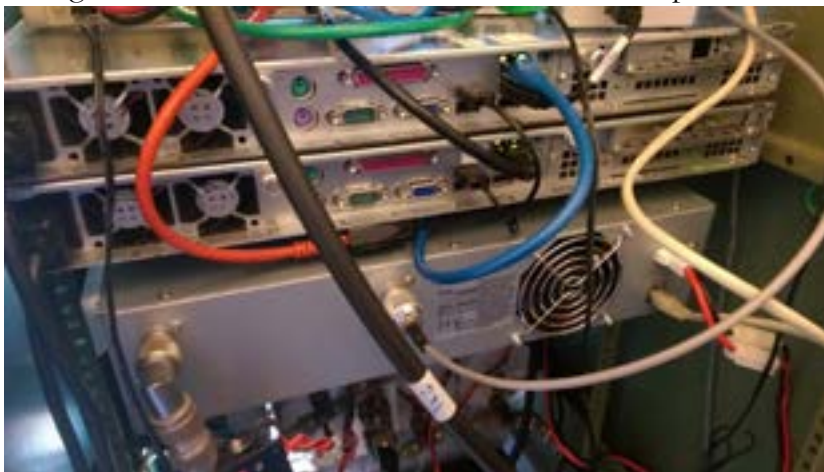
Dstar repeater, gateway and controller servers remounted to the rack to be self supporting.

The same day Patrick and I also noticed a lot of extra N to SO-239 adapters and right angle adapters on the D-STAR repeater, and a extra piece of coax that was joined together with a gender changer and barrel connector. We removed the adapter and extra cable.